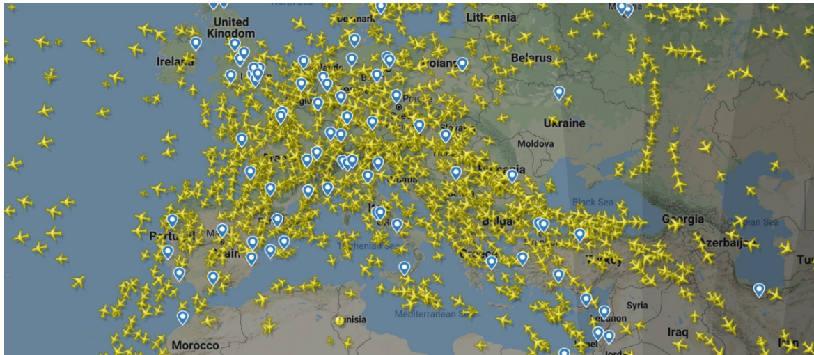
Figure 1: Planes over Europe, 2 nd October, 2018 at 5:30 pm 4

Anyone who at any given point in time looks at the planes simultaneously in the air over Europe (Figure 1), wonders involuntarily whether this picture represents an efficient and optimal system. It seems obvious that improvements would be conceivable.