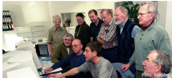
personal computer and internet course