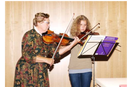
Cross-generational concert 2011