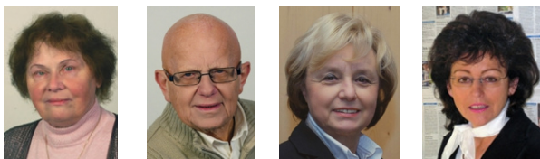
Seniors` management team

Seniors are awarded a “Seniors diploma” after successfully participating in eight semesters in a ceremony with the Rector of the Chemnitz University of Technology, guests of honor and the Scientific Director of Seniors College.