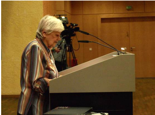
Speech of the oldest participant