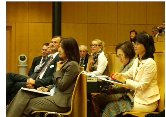
International Forum: Lifelong Learning 2011