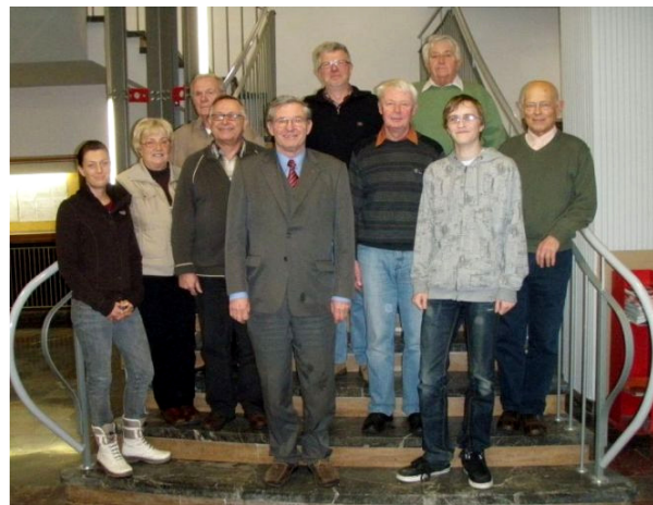
European Grundtvig – project group