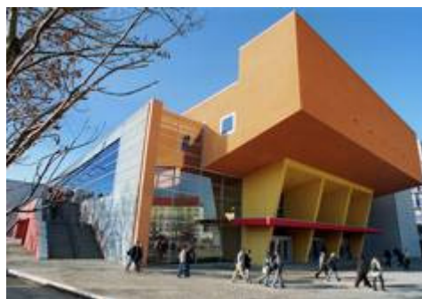
Central lecture building Reichenhainer Straße 90

Homepage: www.tu-chemnitz.de/seniorenkolleg