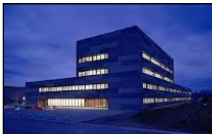
Physikgebäude, Technische Universität Chemnitz