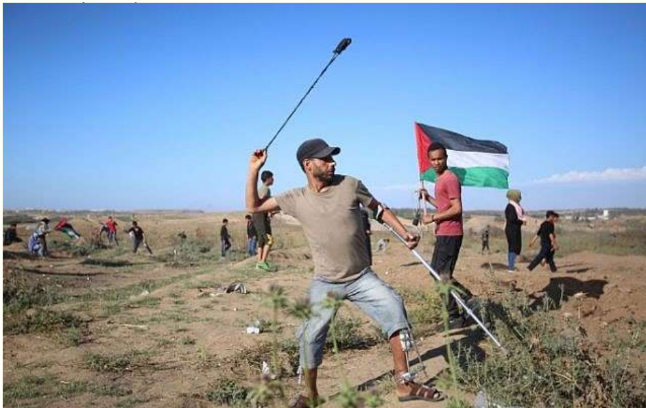
Picture 6: Palestinians clash with Israeli troops during protests at the Israel-Gaza border, on May 3, 2019.